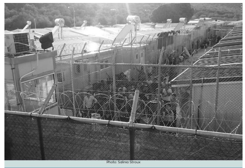
In Moria hotspot on Lesvos, access to information on refugee rights and access to legal aid for family reunifications is not guaranteed. In the beginning of September, more than 750 unaccompanied? minors were in Moria.

Of particular importance are also cases where families have been split after arriving and seeking asylum in Greece. Germany has persistently refused such family reunifications where one member of the family has subsequently applied for asylum in Germany. These applications are in their overwhelming majority rejected as "arbitrary" and "outside the time limit". Specifically, Germany rejects almost all cases concerning spouses who got separated after first arriving and registering in Greece together and of young minors that arrived unaccompanied in Germany d after being first in Greece with their families. Following the conclusion of the problematic August 2018 Administrative Arrangement, the Greek Asylum Service decided in October 2018 not to send 'take charge' requests for the latter cases (young unaccompanied minors in Germany). The Greek Asylum Service Director stated that specifically practices of separation concerning unaccompanied minors are against the best interest of child and for this reason instead of Greece sending an Article 17 (humanitarian clause) 'take charge' request, a 'take back' request would be sent by Germany for the return of the child and the reunification with his/her family in Greece.<sup>39</sup>