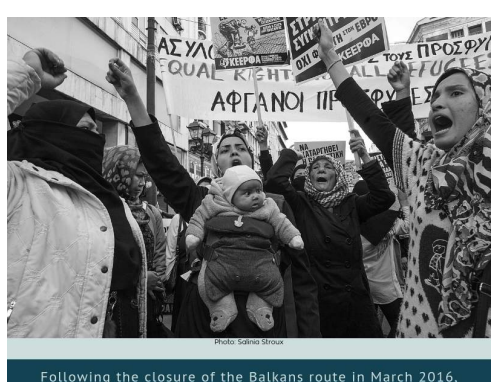
Following the closure of the Balkans route in March 2016, refugees stuck in Greece held repeated protests demanding the re-opening of route so they could re-unify with their loved ones.

elsewhere in Europe – most of them in Germany - with whom they wished to reunite.<sup>4</sup> As the situation developed, most Regional Asylum Offices including the newly established Regional Asylum Offices on the islands were overwhelmed with asylum claims and the asylum system in the whole country paralyzed. Therefore, registration of family reunification requests became a big challenge. The severe delays in the registration of the asylum claims reaching up to several months resulted from the lack of actual capacity to handle such a number of claims. In some cases, these delays rendered the fulfillment of the right to family reunification impossible.