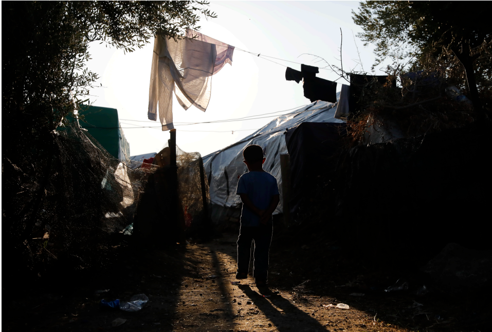
Child living in the "Olive Grove" adjacent to Moria camp, Lesvos, Greece – September 2019.